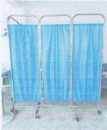
Medical Privacy Screens with Wheels (Stainless, 3-Fold)