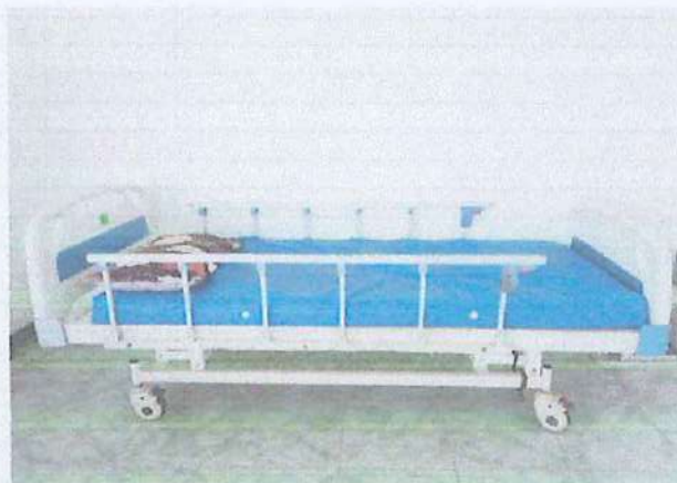
3-Crank Hospital Bed with Mattress